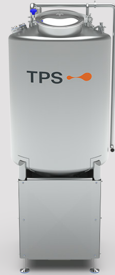
Shear performance 2600 rpm